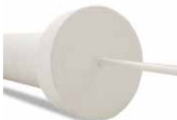
Fiber plug with protective gas connection, suitable for many laboratory applications (gas supply system 1)

Gas supply system 1 is a basic version for static tube furnaces, for operation with non-flammable process gases. This system is not completely gas-tight and can therefore not be used for vacuum operation.