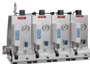
Gas panels with mass flow controllers

Gas supply system 4 allows operation with a hydrogen atmosphere starting at ambient temperature. During hydrogen operation, a pressure of approx. 30 mbar is ensured in the working tube. At the gas outlet the hydrogen is burnt off in an exhaust gas torch. Equipped with a safety PLC control system, pre-purging, hydrogen inlet, operation, fault monitoring and purging at the end of the process are carried out automatically (with at least five times the volume of the tube). If a malfunction occurs, the tube is immediately purged with nitrogen and the system is automatically switched to a safe status.