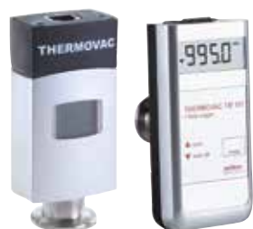
Furnace-unrelated measuring device for a pressure range of 10^{-3} mbar or 10^{-9} mbar