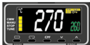
Example of an over-temperature limiter