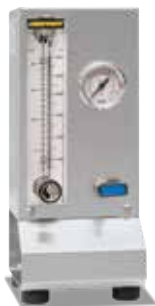
Gas panel for one non-flammable process gas ( N_2 , Ar, He, CO_2 , air, forming gas*)

Gas supply systems for non-flammable process gases are also available for RSRB and RSRC rotary tube furnaces.