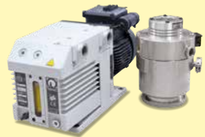
Turbomolecular pump with upstream pump (similar to picture)