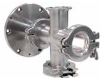
Window as additional equipment for gas-tight flanges