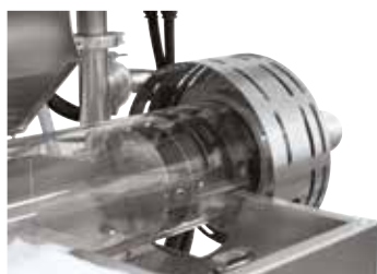
Flange with heat radiation protection insert (gas supply system 15)

Gas supply system 2 with water-cooled flanges is available for R, RHTC, RHTH, RHTV, RSH and RSV furnaces. Cooling water supply with NW9 hose connector to be provided by the customer.