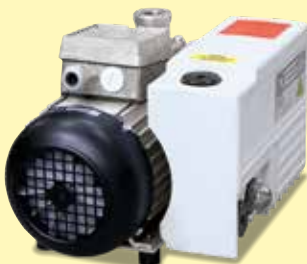
Single-stage rotary vane pump (similar to picture)