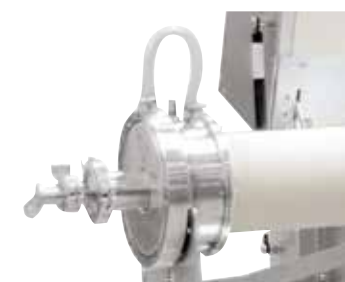
Water-cooled vacuum flange (gas supply system 2)