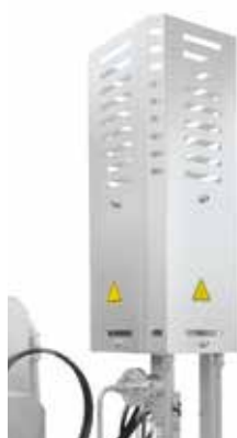
Example of a torch