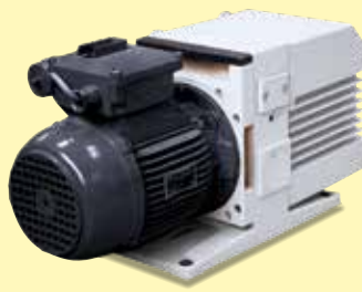
Two-stage rotary vane pump (similar to picture)